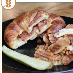
Fig & Onion

Sweet & Smoky! A Flaky, Buttery Croissant topped w/ crispy Bacon, Cinnamon Sugar Apples, Lowville Maple Cheddar Cheese & a drizzle of Maple Syrup, then toasted to perfection.